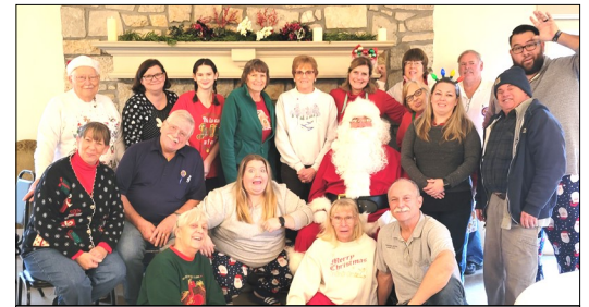
2022 Pancake crew - end of shift None the worse for wear. (Yeah.....They looked like this when they started.-ed)