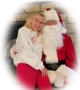
Santa and....not Mrs. Claus (This must be one of those "Don't ask, don't tell situations -ed)